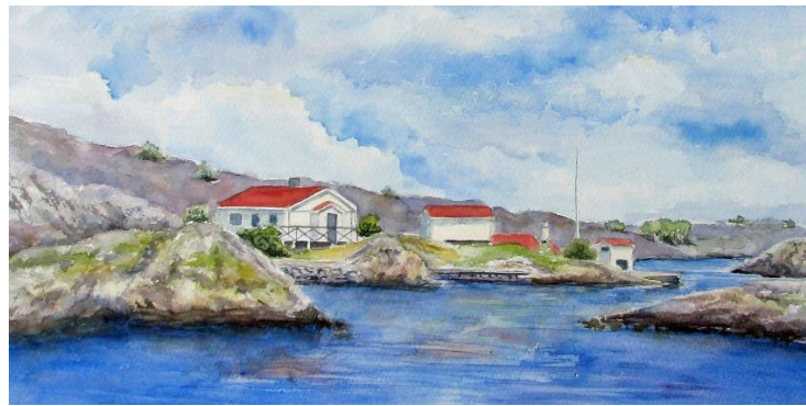
Gotteberg Cottage 12 x 20