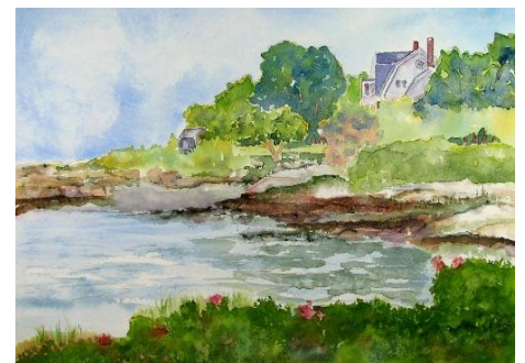
Cohasset Coastline 16 x 20