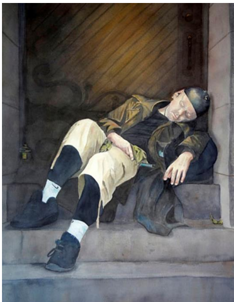
Urban Anqel 36 x 28