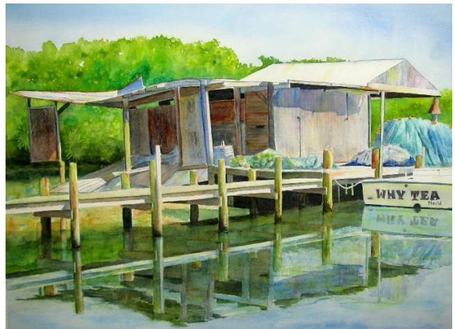
Cortez Fishing Shack 28 x 36