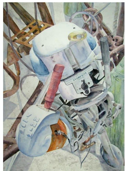
Vintage Trolling 36 x 28