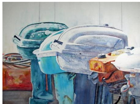
Vintage Motors 28 x 36