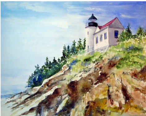
Bass Head Harbor 16 x 20