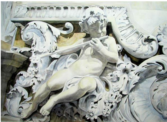
Carved Fautist 28 x 36

I am in awe of the spiritual aspect of nature and art. Everything could have been designed in shades of gray but instead we are startled and captured by unending colorful displays. The artist and the viewer share discernment and the ability to create and enjoy the art. I feel totally blessed to be painting and participating in a creative process which brings enjoyment to others as well as myself.