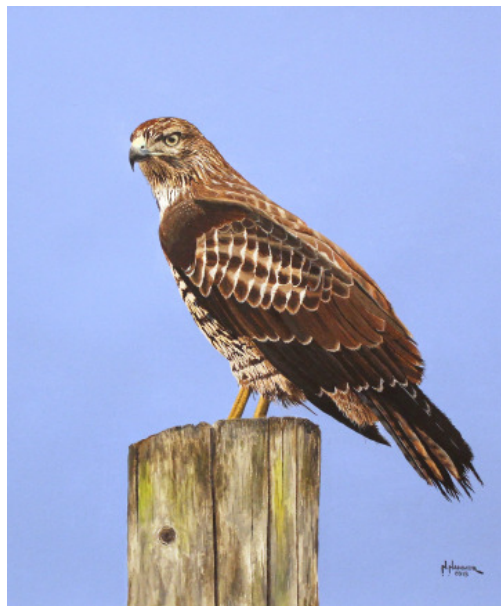
Red-tailed Hawk II