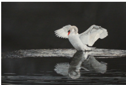
Mute Swan II