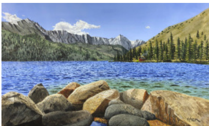
Twin Lakes, Riverside, CA