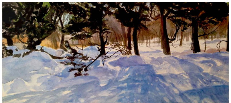
February Blues Watercolor on paper