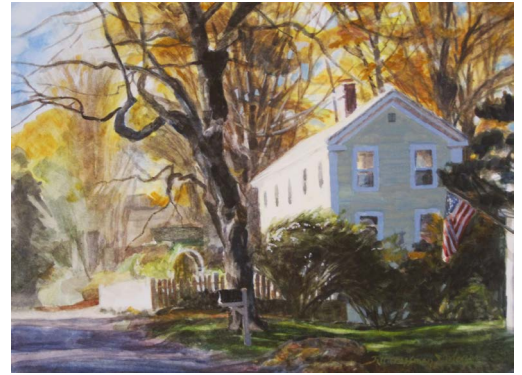
Maple Street Autumn Watercolor on paper

We were encouraged back in art school to paint non-representationally, but after graduation I taught myself to paint landscapes, on Saturday afternoons when my two daughters were otherwise occupied. Recently I have started to learn about portraits.