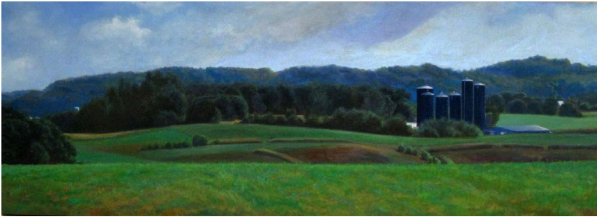
Baraboo Hills Acrylic on canvas